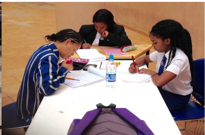
Beta team preparing for the 'Books