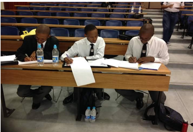
Alpha team in 'debate mode'